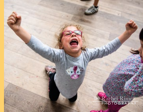
Rachel Rimell PHOTOGRAPHY