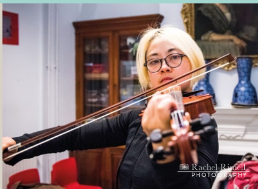
Rachel Rimell PHOTOGRAPHY