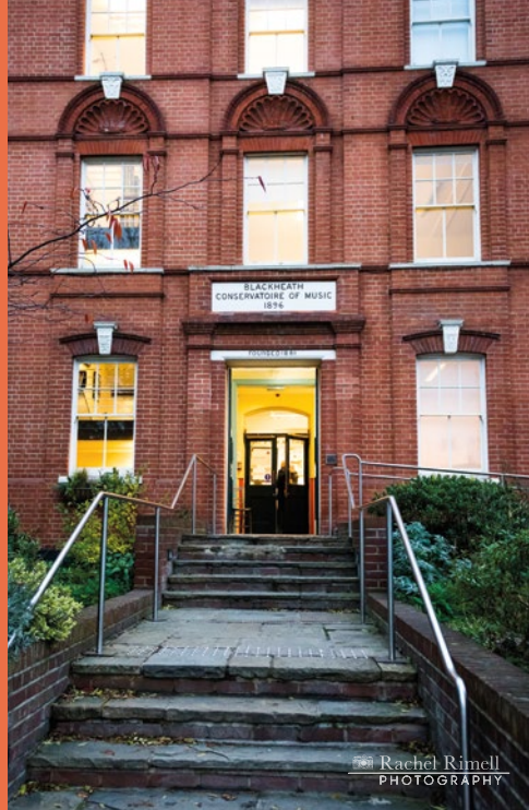
Rachel Rimell PHOTOGRAPHY

Whilst we are renowned for our music, art and drama classes, we are keen to offer other courses which offer opportunities for cultural enrichment, but which don't quite fit into our brochure's clearly delineated sections. You'll find more information about them here!