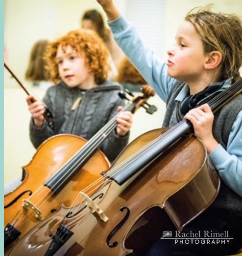
Rachel Rimell PHOTOGRAPHY