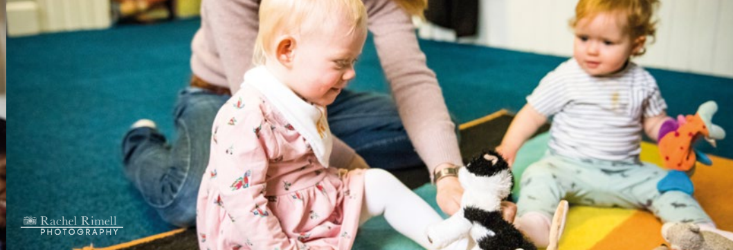
Rachel Rimell PHOTOGRAPHY