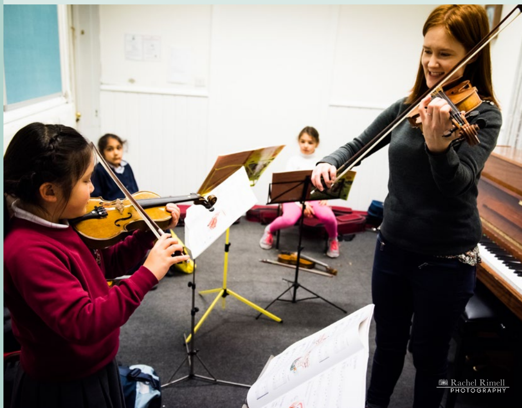
Rachel Rimell PHOTOGRAPHY

Due to changes that we have made to the programme to allow us to continue teaching group classes throughout the Coronavirus pandemic; there are no Play! Cello or Brass classes available this term. Please contact us to go on our waiting list for the September term when we will be opening up new class intakes again.