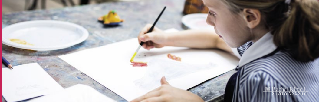
Rachel Rimell PHOTOGRAPHY