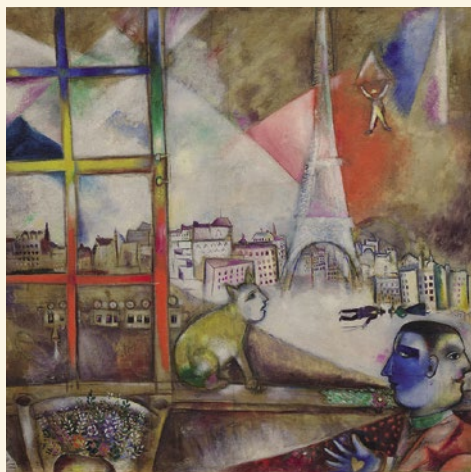
Marc Chagall, 1913, Paris par la fenêtre ( Paris Through the Window )