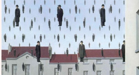
René Magritte, Golconda , 1953, detail.