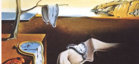
Salvador Dalí, The Persistence of Memory , 1931, detail. Oil on canvas. © Salvador Dalí, Gala-Salvador Dalí Foundation/Artists Rights Society (ARS), New York