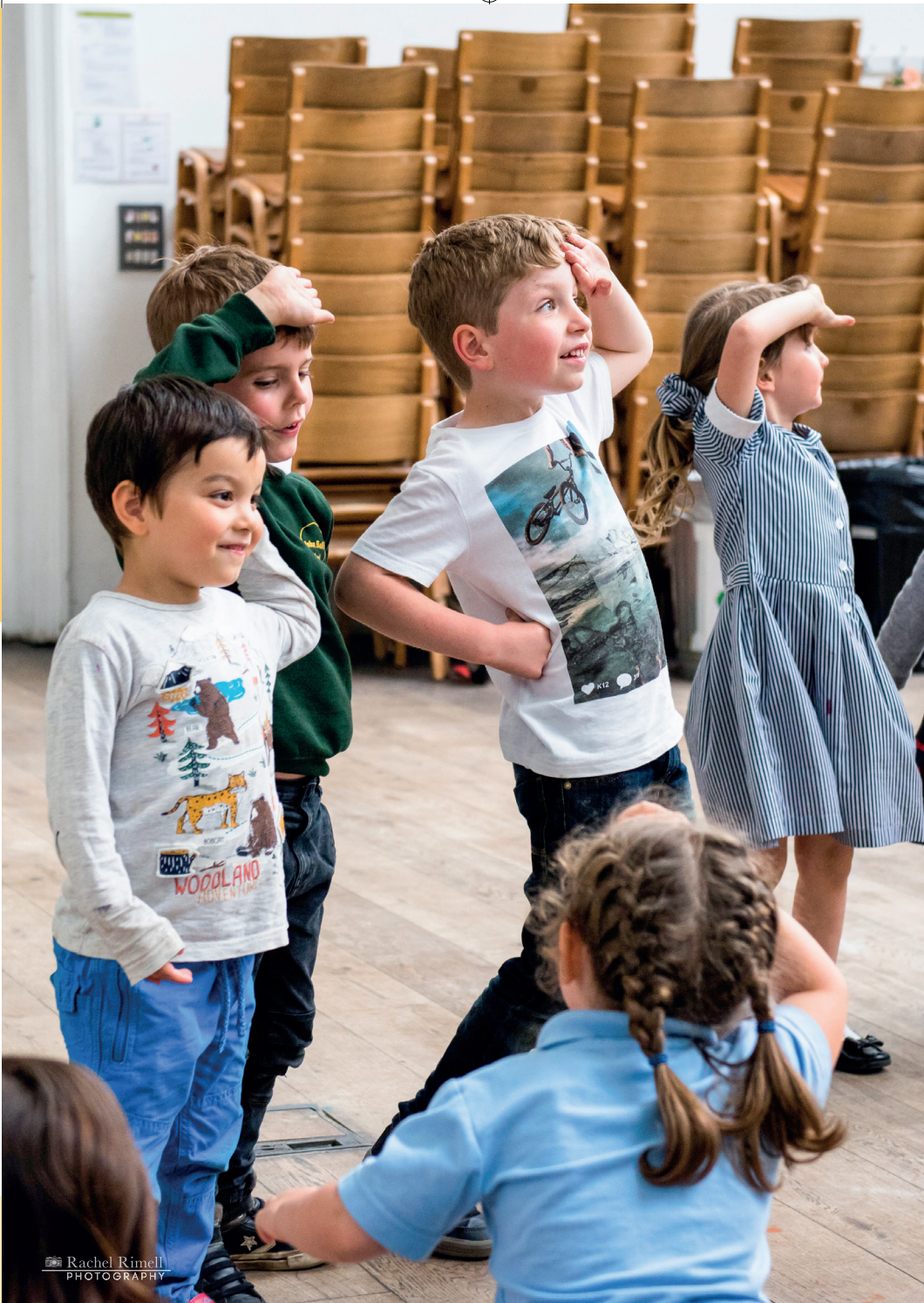
DRAMA FOR EARLY YEARS (18 MTHS - 7 YRS)