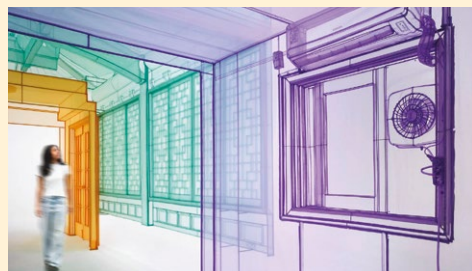
Nest/s 2024 © Do Ho Suh.

This summer, Do Ho Suh has an exhibition at Tate Modern in London, called 'Walk The House'. His work explores spaces – the Exhibition has reconstructions of houses in which he has lived, and explores memory and migration. He uses lots of different materials, as we will in this workshop. Coloured acetates will separate spaces, and we can create some wood effects using rubbings, wax resist and printing and use these to make our own mini houses. Will you create your own house, or will you create a brand new one?