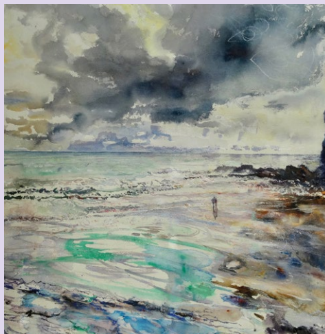
Lone couple look out to sea, Crackington Haven, Cornwall – Sophie Knight